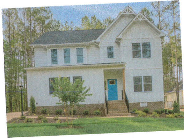
Exhibit B Conceptual Elevations