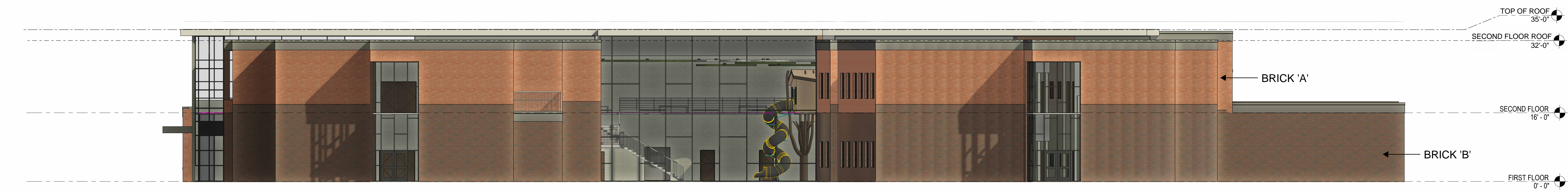
2 EXTERIOR WEST ELEVATION A2.1 1" = 10'-0"