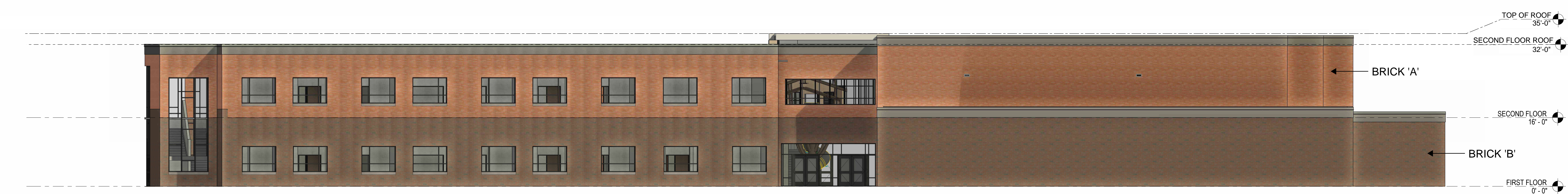
1 EXTERIOR SOUTH ELEVATION A2.1 1" = 10'-0"

ALL REPORTS, PLANS SPECIFICATIONS AND COMPUTER FILES RELATIVE TO THIS PROJECT ARE THE PROPERTY OF CRABTREE ROHRBAUGH & ASSOCIATES. CRABTREE ROHRBAUGH & ASSOCIATES RETAINS ALL COMMON LAW, STATUTE AND OTHER RESERVED RIGHTS INCLUDING THE COPYRIGHT RIGHTS TO REPRODUCTION OF THIS MATERIAL. NO PART OF THIS DOCUMENT MAY BE REPRODUCED OR TRANSMITTED IN ANY FORM OR BY ANY MEANS, ELECTRONIC OR MECHANICAL, INCLUDING PHOTOCOPYING, RECORDING, OR BY ANY INFORMATION STORAGE AND RETRIEVAL SYSTEM, WITHOUT THE WRITTEN PERMISSION OF CRABTREE ROHRBAUGH & ASSOCIATES. VIOLATION OF THE COPYRIGHT LAWS OF THE UNITED STATES AND WILL BE SUBJECT TO LEGAL PROSECUTION. © CRABTREE ROHRBAUGH & ASSOCIATES, INC 2023