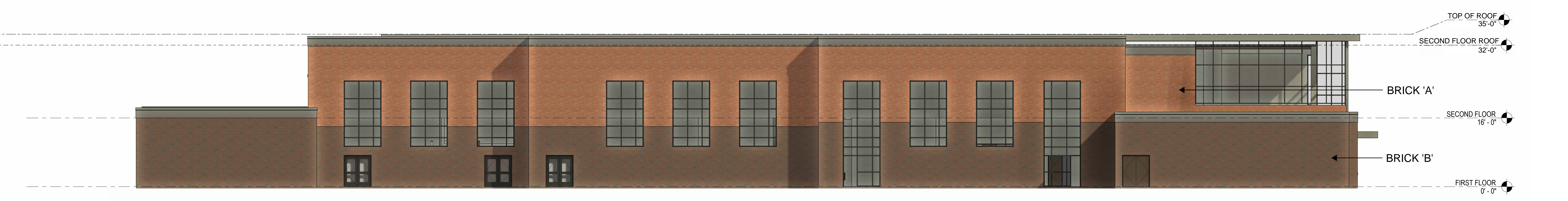
4 EXTERIOR EAST ELEVATION A2.1 1" = 10'-0"