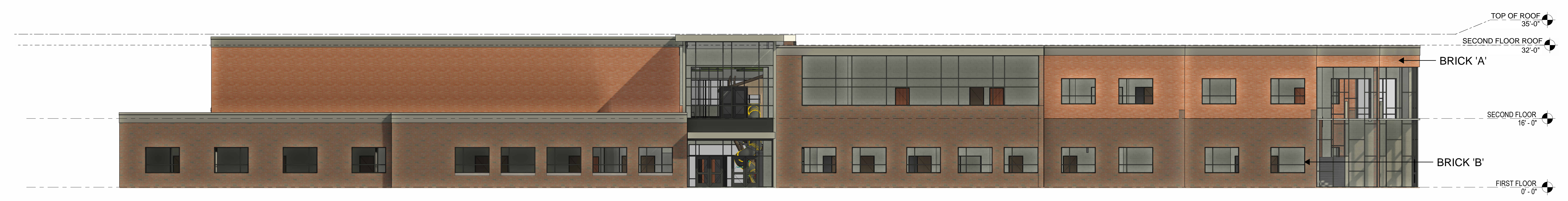
3 EXTERIOR NORTH ELEVATION ELEVATION FACING BEAVERDAM SCHOOL ROAD A2.1 1" = 10'-0"